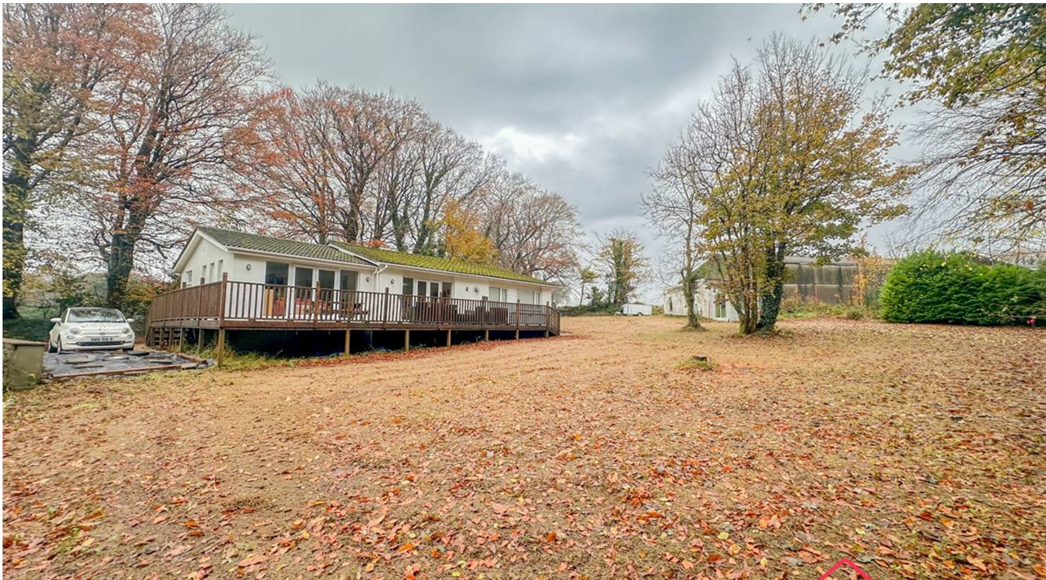
The Bungalow Fuchsia Gardens,, Mount Rule, Douglas, Isle of Man, IM4 4HT Asking Price £550,000